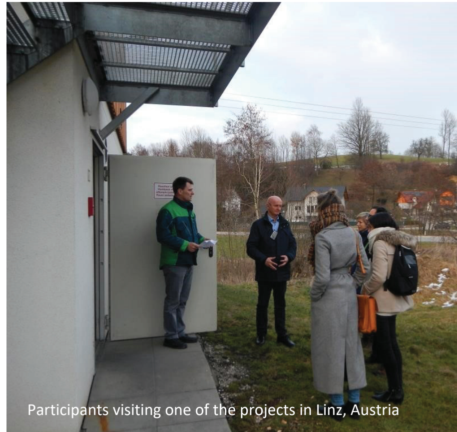
Participants visiting one of the projects in Linz, Austria