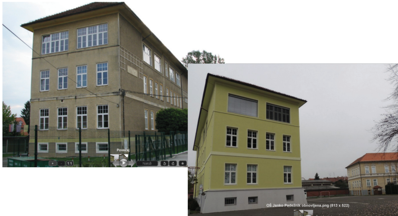
One of the 24 renovated public buildings in the municipality Maribor (primary school)

Koekelberg enhanced their wider capacities by using the existing framework which can link local governments together. They recognised the value of this relationship particularly when collectively engaged in finding financial support for energy saving schemes.