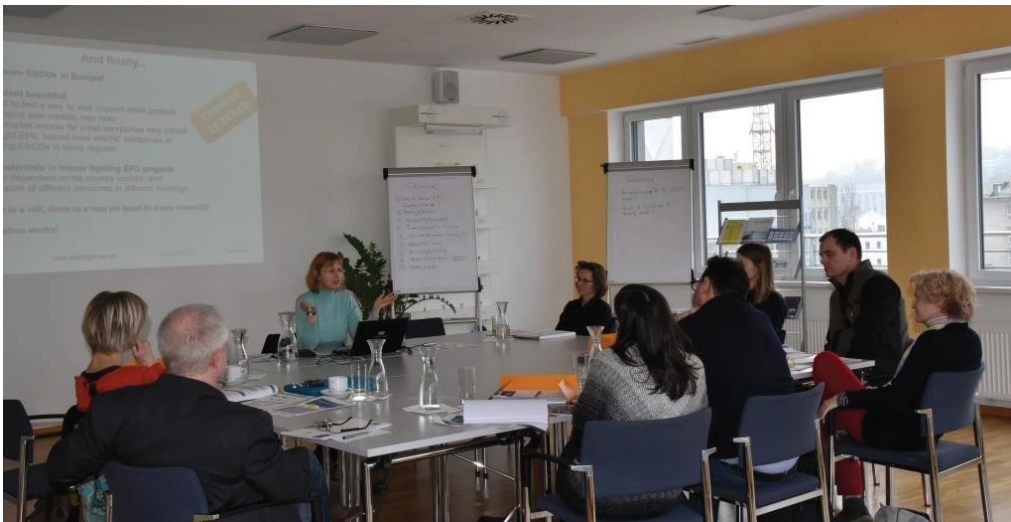
Participants discussing about EPC as an innovative financing scheme