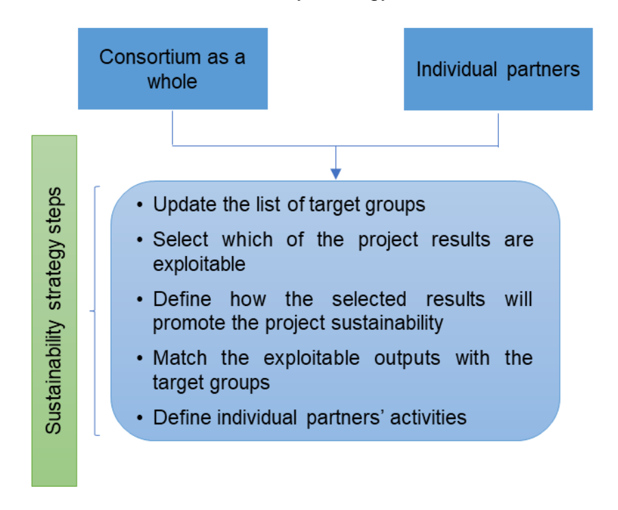
Figure 1: Methodology for the sustainability strategy

The figure below gives an overview of the methodology to be followed towards the development of PROSPECT sustainability strategy